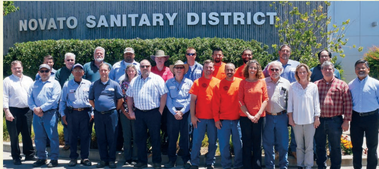
Staff recognized for the national Platinum5 Peak Performance Award.

The National Association of Clean Water Agencies (NACWA), awarded Novato Sanitary District's Wastewater Treatment Plant a Platinum5 Peak Performance Award, which is given for perfect permit performance records for five consecutive calendar years.