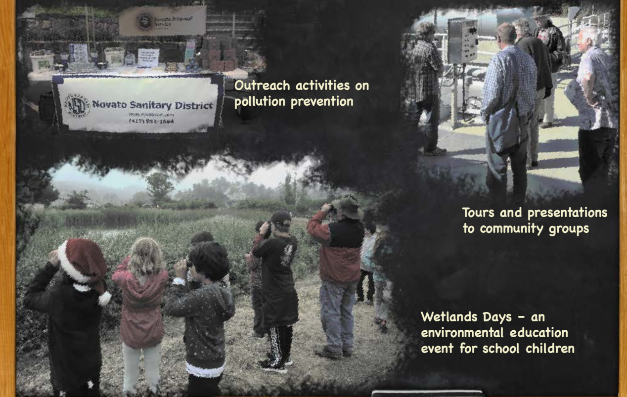
Outreach activities on pollution prevention

Novato Sanitary District collaborates with Marin County sanitation agencies to support innovative programs to educate children about wastewater treatment, improve science and math understanding, and help individuals learn how they can protect the environment. Examples include: